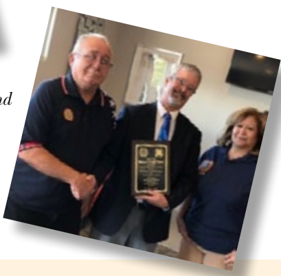
VFW Post 3715 presenting award